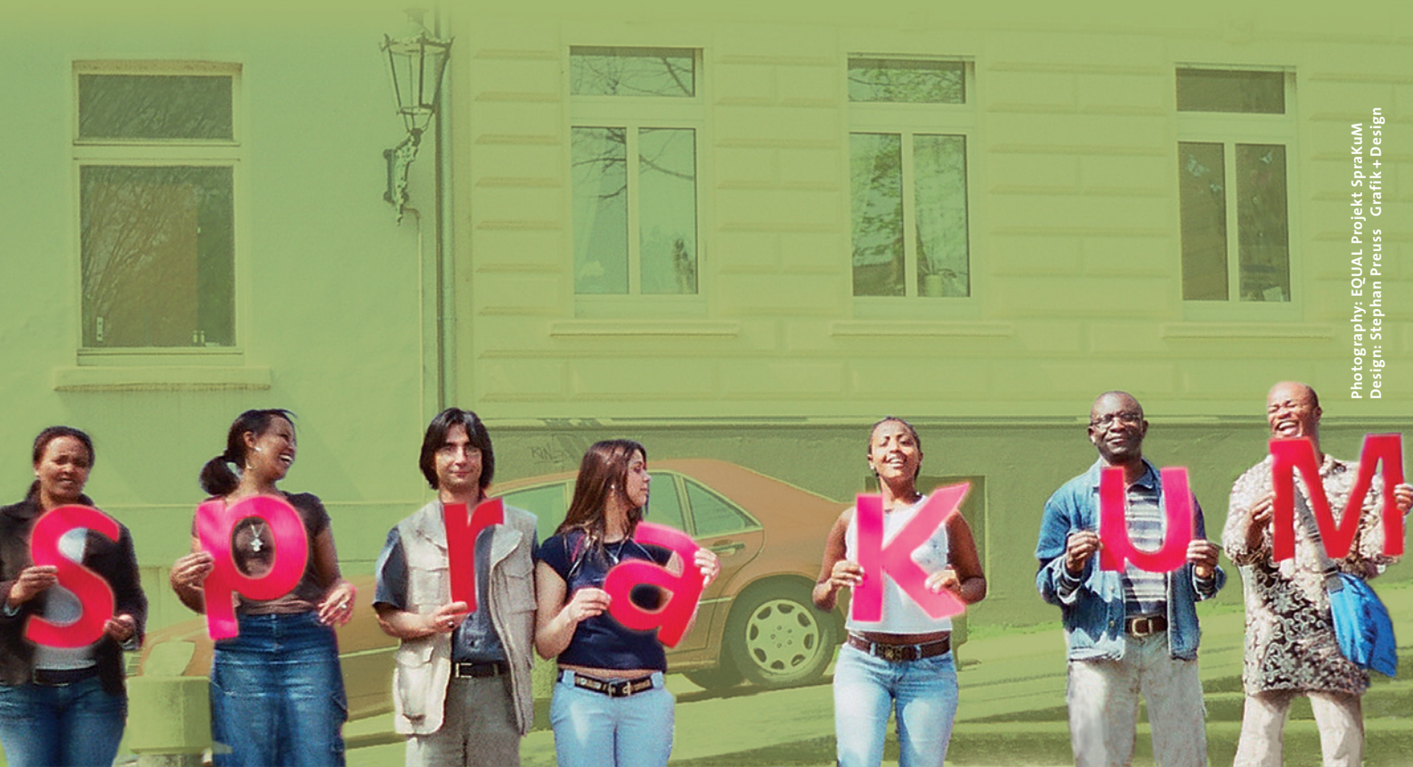
Design: Stephan Preuss Grafik + Design

Diakonie Wuppertal EQUAL Project SpraKuM